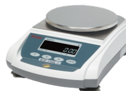
PG-1000, FB-2000 / 3000