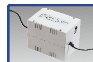
AC / DC Adaptor