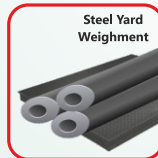
Steel Yard Weighment