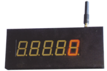
Wireless Remote Display (Option)