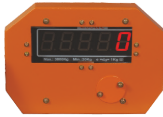
Thermal Scale with cover