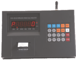
Wireless Remote Indicator with Printer (Option)