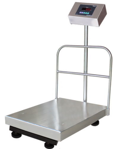
DS-215SS Platform Scale